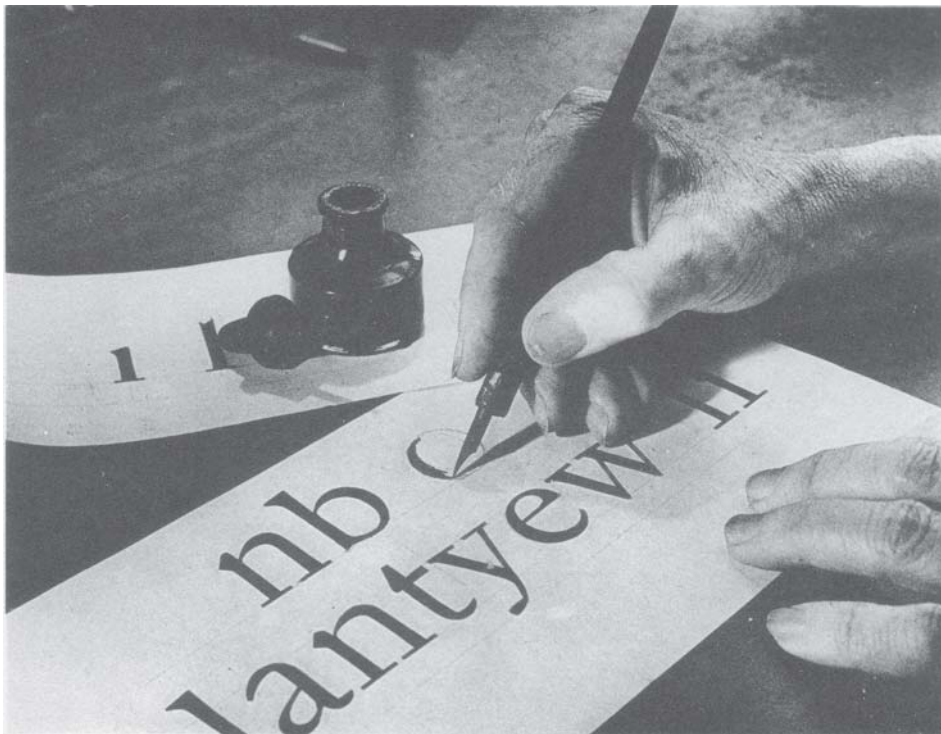
W. A. Dwiggins beim Schriftentwurf

Ein Originaldruck befindet sich im Klingspor-Museum